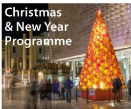
Christmas & New Year Programme

Gozo & Comino in One Day Winter Tour (Full Day): € 35; Notte Bianca in Valletta: € 15; Marsaxlokk Fishing Village, St Peter's Pool Bay & Blue Grotto (Full Day): € 17; Orientation Walk at St Julian's : € 10; Mdina by Night: € 19; The Three Cities Historical Tour by Night including dinner at Birgu Waterfront: € 28; Evening Dinner - Traditional Maltese Food: € 35; San Anton Gardens, The Three Villages (Lija, Attard & Balzan): € 15; Rabat, Buskett Forest, Dingli Cliffs & Mosta Dome Tour: € 17; Birgu by Candlelight at the Three Cities : € 15; Full Day Visiting Historic Temples: € 40; Golden Bay & Majjistral Nature & History Park Walking Tour: € 17; Valletta by Night: € 10; Mdina & Ta' Qali Crafts Village: € 17; Night out in St. Paul's Bay & Bugibba : € 10; Malta National Aquarium, Bird Park & St Paul's Bay: € 27; Luzzu Night Harbour Cruise: € 17; Dinner at Spinola Bay: € 35